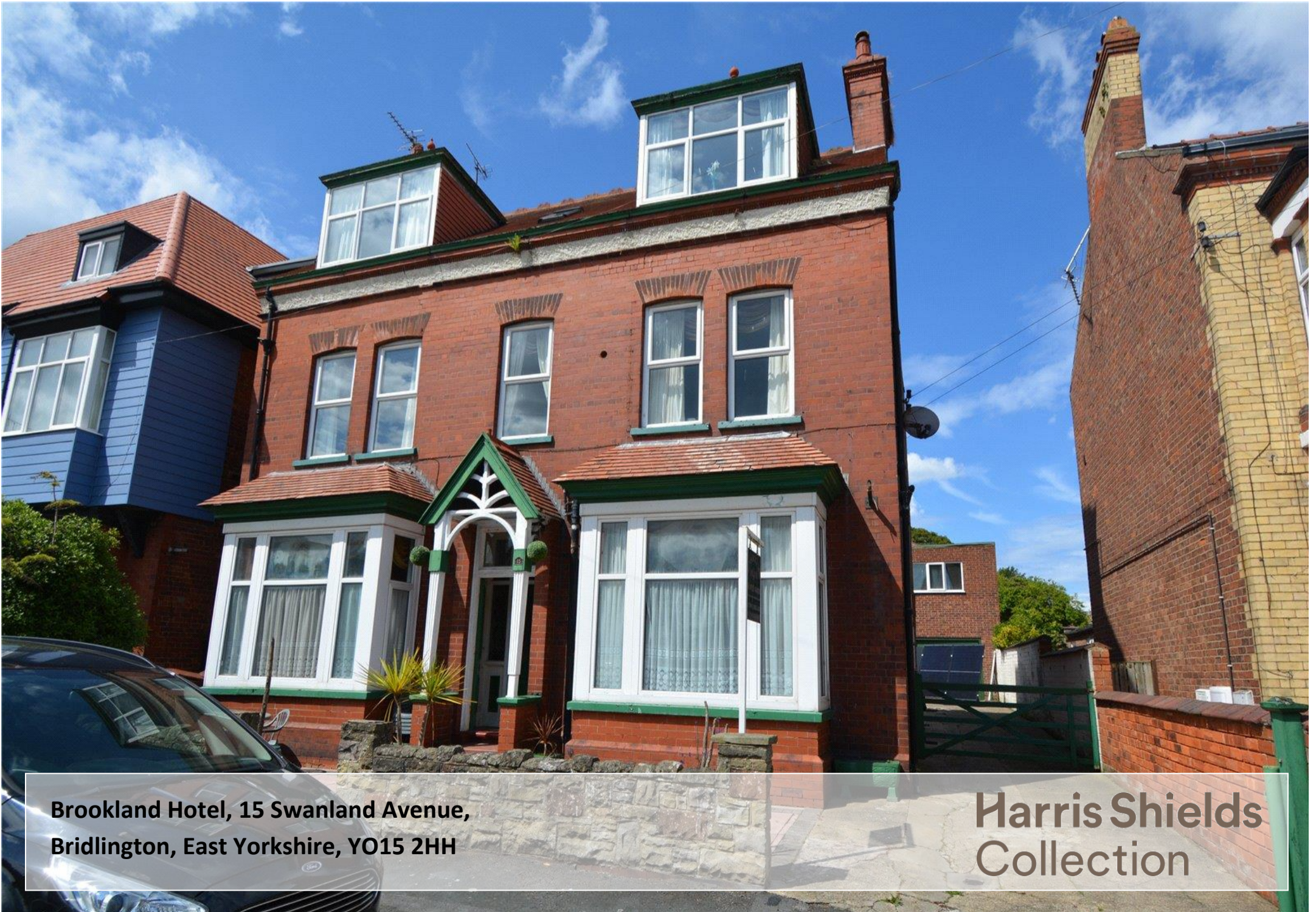
Brookland Hotel, 15 Swanland Avenue, Bridlington, East Yorkshire, YO15 2HH